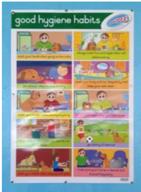
Figure 1: Poster on hygiene habits to the right of the sinks