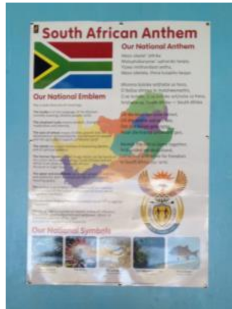
Figure 2: Poster on South Africa Facts to the left of the sinks