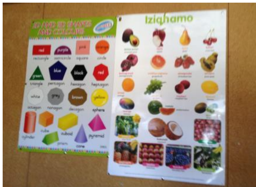
Figure 3: A posters on colors and shapes and a poster on fruit hung in the storage bungalow